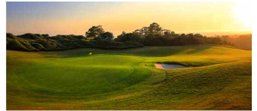
The greens will keep you on your toes

If you are considering setting your sights on a golfing holiday that takes