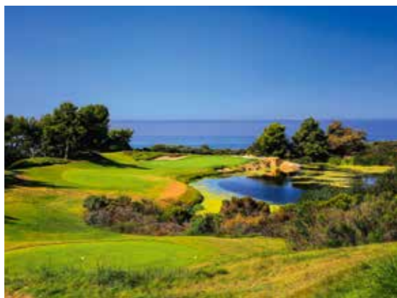
The stunning 7th hole on the Ocean South course

Pelican Hill is one of the leading golf resorts in the States, boasting two Tom Fazio-designed golf courses, 204 bungalows and 128 villas. Its incredible location on the hills, just over a mile from the beach, offers stunning views of the Pacific Ocean towards the island of Catalina. A glance at the