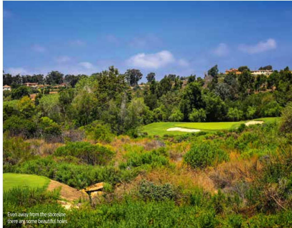
Even away from the shoreline there are some beautiful holes

flora and fauna, and offers year-round playability for golfers of all standards thanks to five sets of tees on each hole. Oak Creek is open to the public daily.