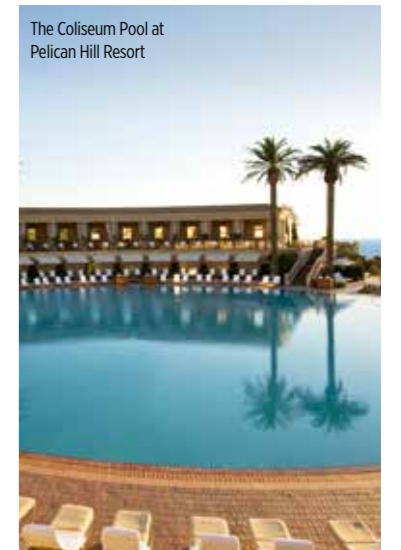
The Coliseum Pool at Pelican Hill Resort

Newport Beach is a great place to base yourself for any golfing visit to California and if you don't want to stick to one resort, there are plenty of hotels to choose from. The Island Hotel, just a ten-minute drive from Pelican Hill, captures the elegant style of California. There are 294 rooms and it is close to Newport Beach's bustling shopping scene. The hotel's Oak restaurant offers a lively al fresco dining experience as well as a selection of fantastic dishes. We can certainly recommend the fillet steak and warm pineapple cake with salted caramel ice cream. Alternatively, Hotel Irvine, also in the Newport Beach area, is a more affordable option and offers a great base from which to explore. You'll find everything you need here from comfortable, spacious rooms and free Wi-Fi to an excellent swimming pool and fitness centre.