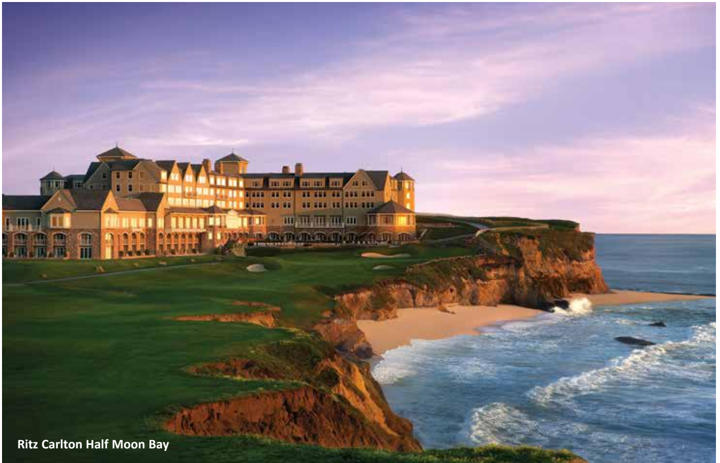
Ritz Carlton Half Moon Bay