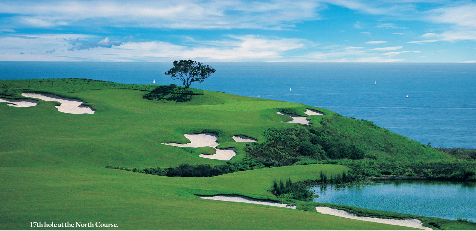
17th hole at the North Course.