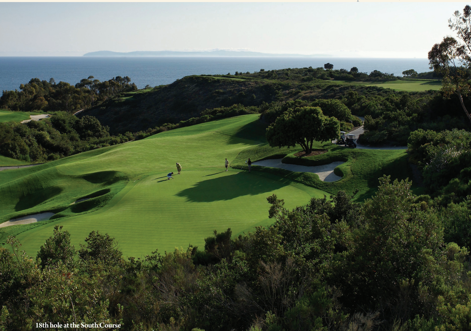
18th hole at the South Course