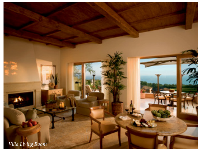
Villa Living Room

The lobby's massive, 28-foot rotunda emphasizes grand proportions and perfect symmetry. Just outside the lobby doors, the balcony lures guests to pristine golf course views nestled against the endless grandeur of a mesmerizing ocean backdrop.