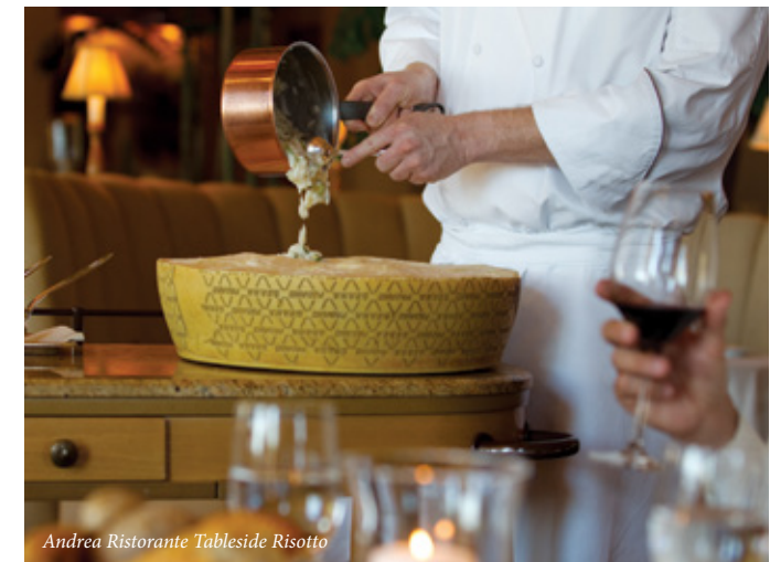
Andrea Ristorante Tableside Risotto

concept with 50-60" flat-screen television, luxury bedding and spacious bathrooms featuring a marble walk-in shower and deep soaking tubs. You can also arrange for a personal concierge, butler and cook upon request. If you're parents on date night, your children will enjoy Camp Pelican with two age-appropriate youth programs providing an entertaining resort vacation on their own terms.