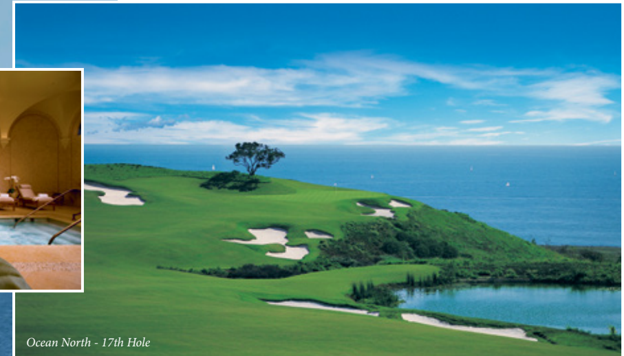
Ocean North - 17th Hole