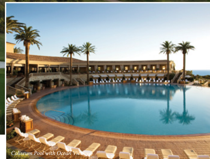
Coliseum Pool with Ocean View