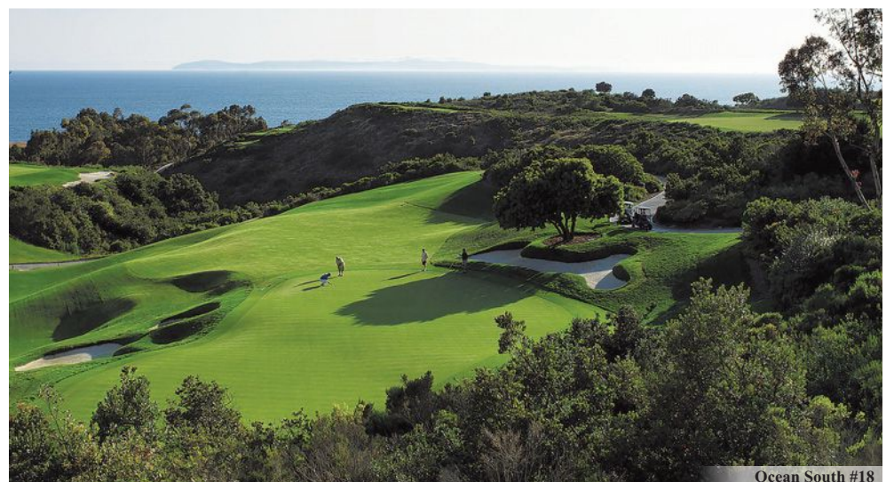
Ocean South #18