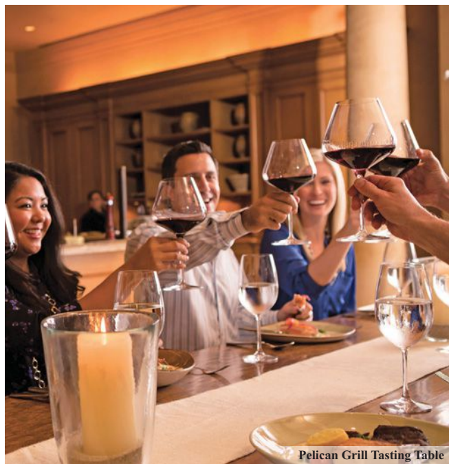
Pelican Grill Tasting Table