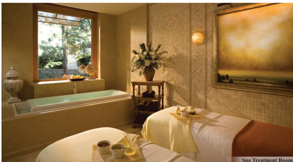
Spa Treatment Room

The Resort at Pelican Hill has invested heavily in The Spa as well as its exemplary staff of professionals. Reinvigorating your body and soul is their mission. They understand the point is to self-indulge. With 22 treatment rooms and a broad menu of services from which to choose, resetting that stress meter is not a problem. The variety of offerings range from aromatherapy, to facial treatments, to skin glow enhancements, to massages of every type including romantic bath collections for couples. The staff can also combine treatments to create a customized experience. For the 10 th year in a row Forbes Travel Guide has awarded The Spa with a Five-Star rating. Additional accolades come from Conde Nast Traveler