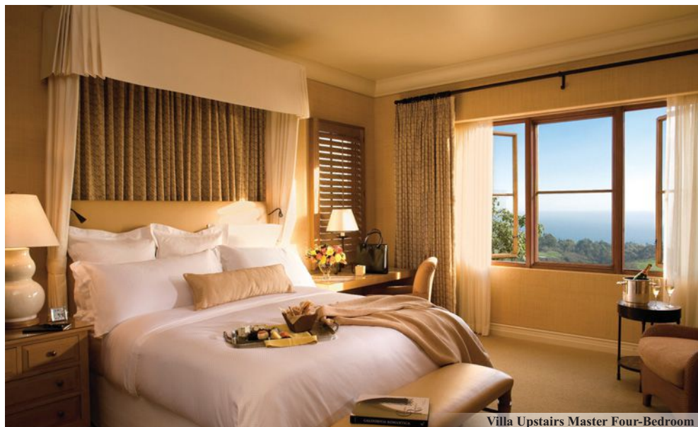
Villa Upstairs Master Four-Bedroom