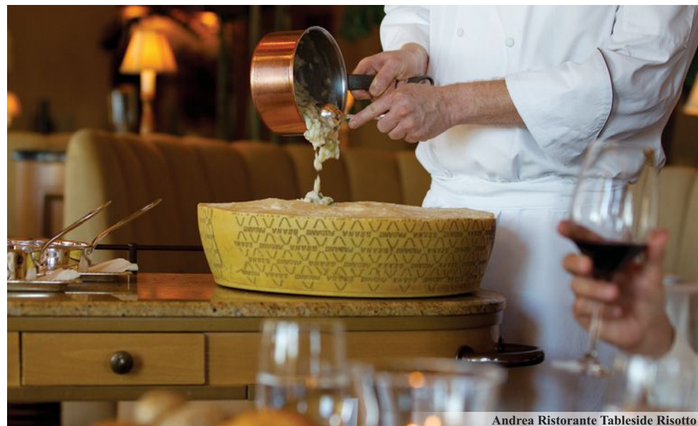
Andrea Ristorante Tableside Risotto