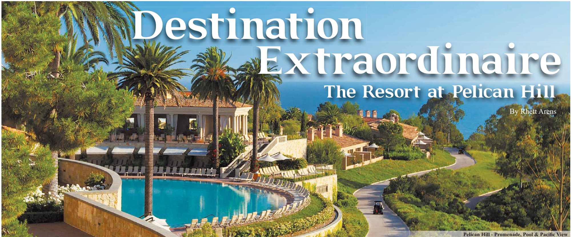
Pelican Hill - Promenade, Pool & Pacific View

From the moment you pass through the vaulted lobby for that first look at the Pacific, The Resort at Pelican Hill is calling for your attention. What is found spread out below you is the stunning, infinity designed Coliseum pool in all its Italian Renaissance splendor. Golfers take note that is the 18 th hole sprawling below the pool's edge to the west. Later in the day it will challenge your nerves and test your swing commitment. This year finds Pelican Hill celebrating 10 years of sending visiting golfers home speechless with a big smile on their face.