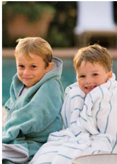
Suite-like cabanas surround the Coliseum and villa pools, while kids have their own area.

feet in diameter, it lays claim to being the largest circular pool in the world, holding 380,000 gallons of saltwater. The radiant blue bottom comes courtesy of 1.1 million mosaic tiles, each one carefully cut and set by hand. Vaulted arches and corniced col-