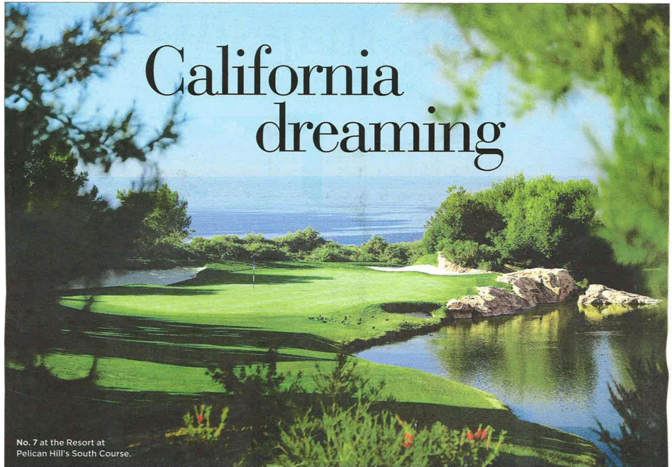
No. 7 at the Resort at Pelican Hill's South Course.